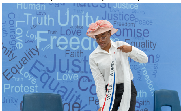
22/23 Touring Show: NO TURNING BACK by Keith McGill

One adult chaperone free per every 10 students