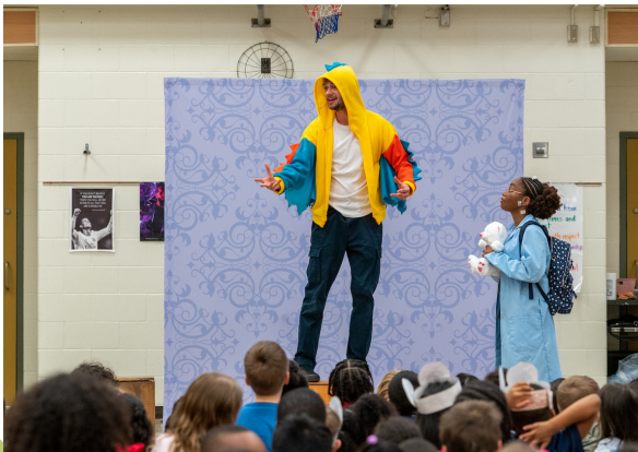
22/23 Touring Show: THE INVENTIVE PRINCESS OF FLORALEE by Maggie Lou Rader